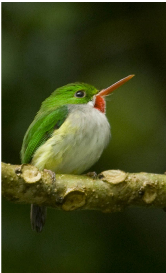
Puerto Rican Tody